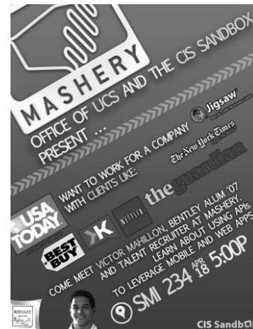
Figure 1. Students create posters and flyers for special events in the CIS Sandbox.